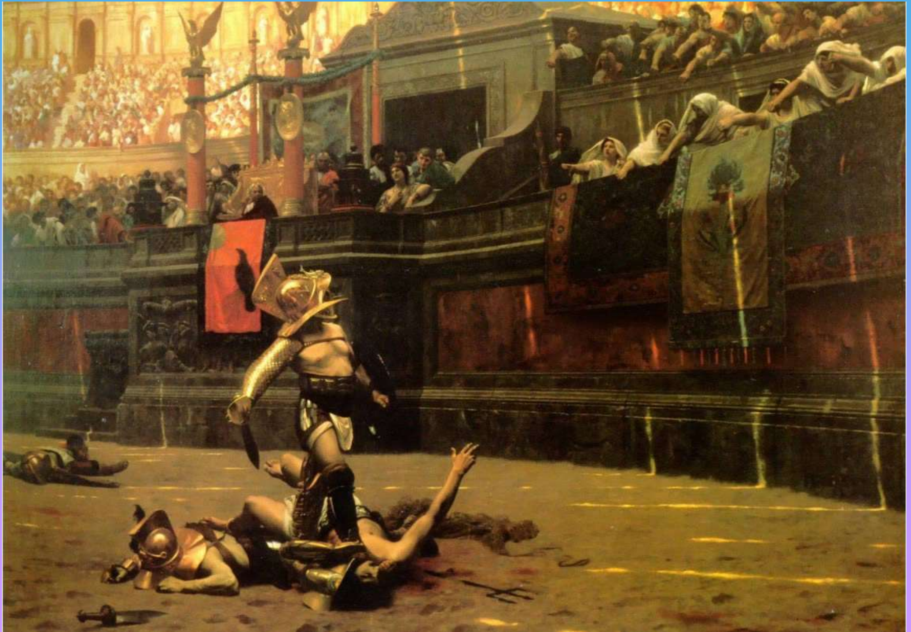
Jean-Lion Gerome - Pollice Verso (With a Turned Thumb), 1872.