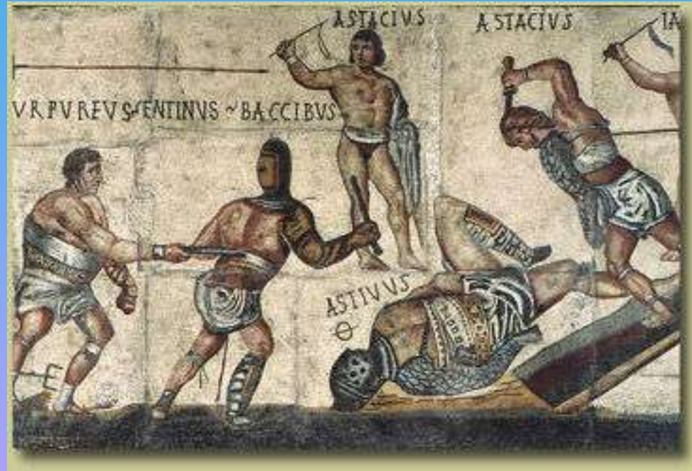
The Gladiator Mosaic located at the Galleria Borghese in Rome

Gladiators fought each other; and sometimes they fought wild animals or condemned criminals.