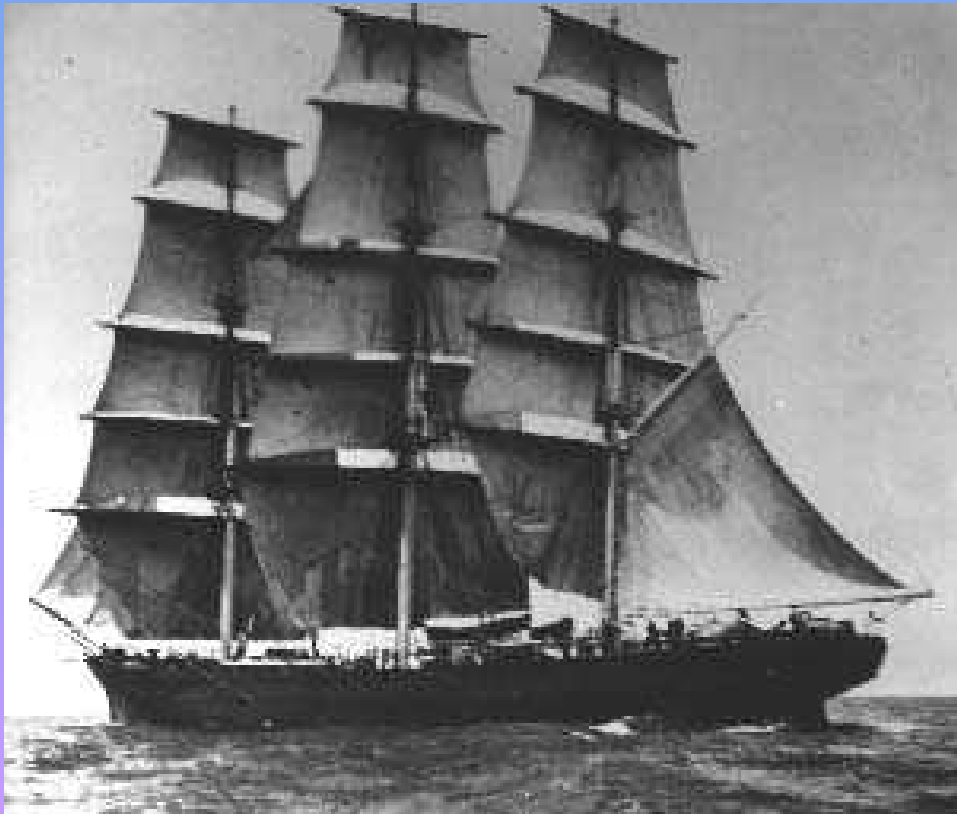
Illustration: Sailing Ship

A sailing boat that loses control in the wind will be tossed about in either direction.