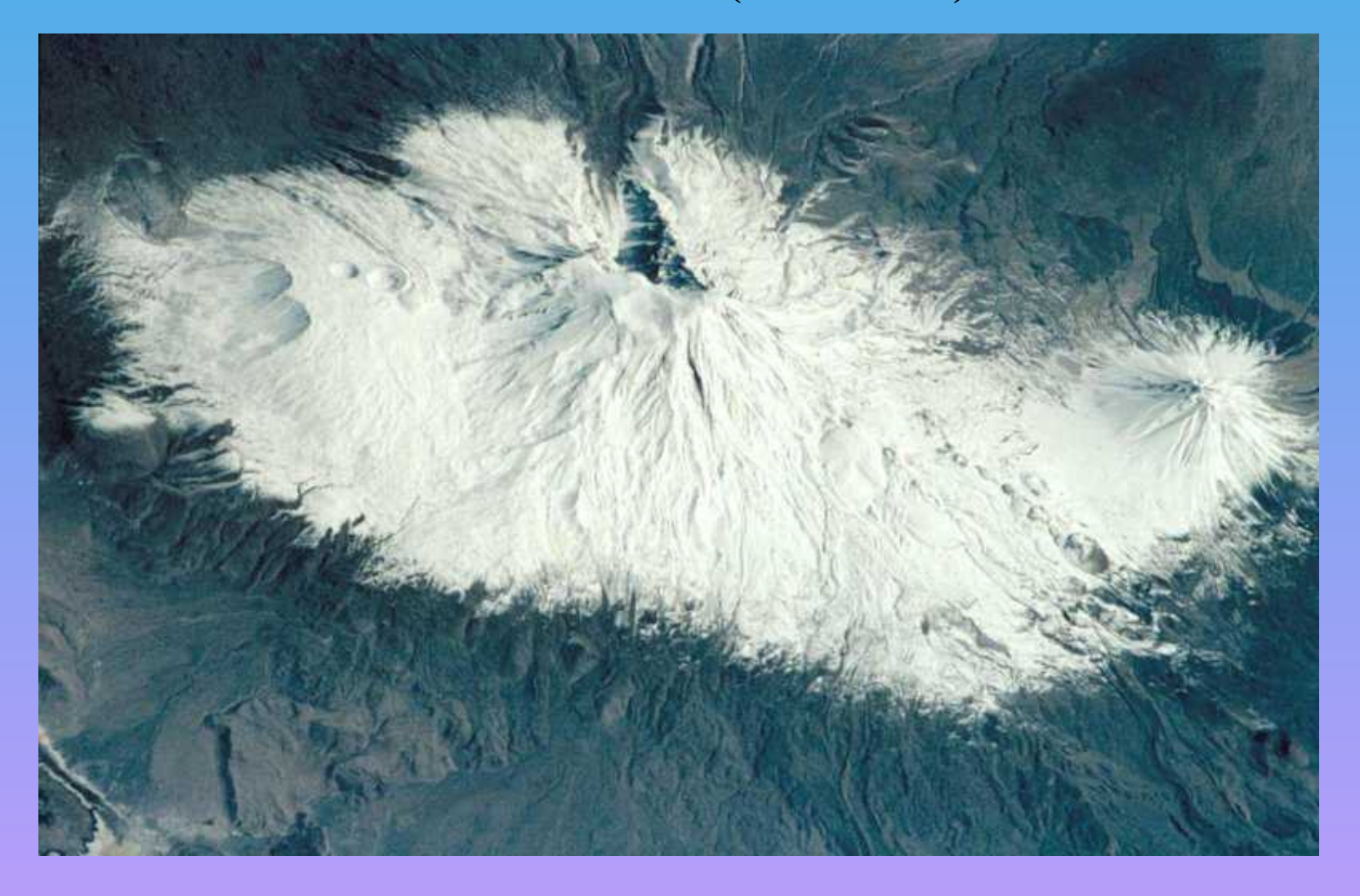
Mount Ararat – Picture by NASA (public domain) Searching for Noah's Ark.